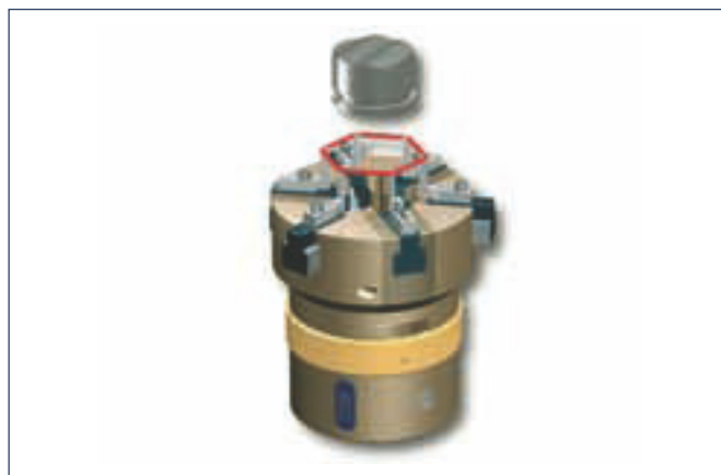
2. Travel to the shaft (assembly position).