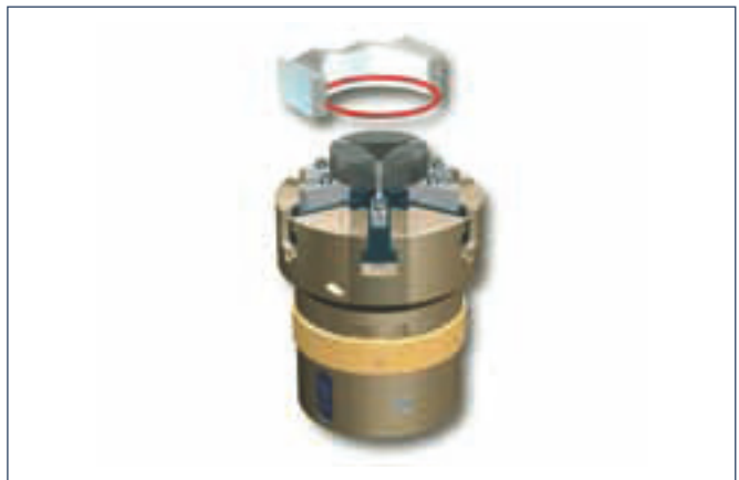
4. Pressing by triple jaw A and retraction of the gripper