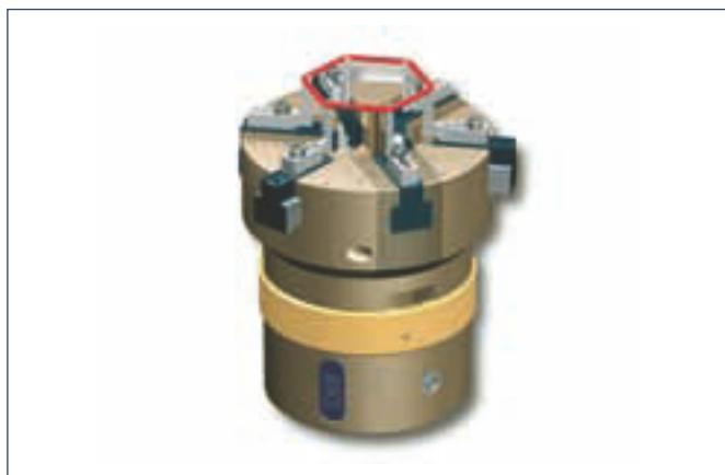
1. Mounting of the o-ring and expansion to a hexagon.