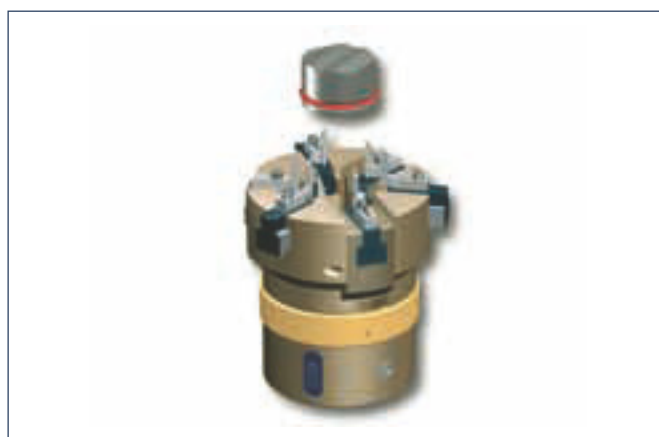
4. Retraction of the whole gripper. The o-ring is completely inserted in the groove now.