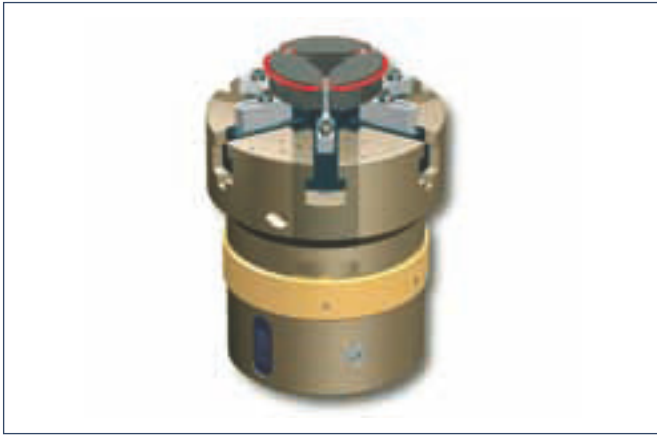
1. Mounting of the o-ring.