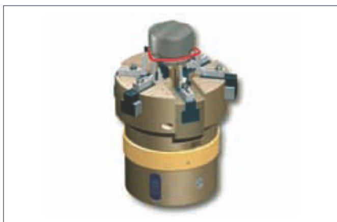
3. Retraction of triple jaw A. The o-ring inserts into the groove.