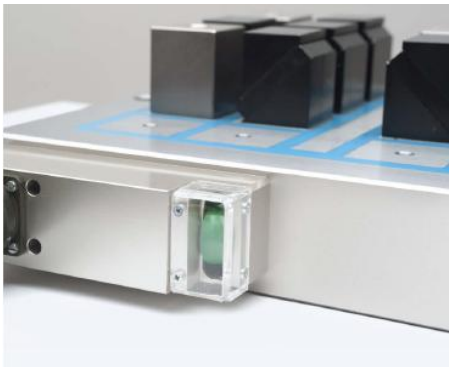
MAG Status: Status display is „green“.

The new and patented status display for SCHUNK-Magnetic chucks enables to monitoring the actual status of the magnetic chuck.