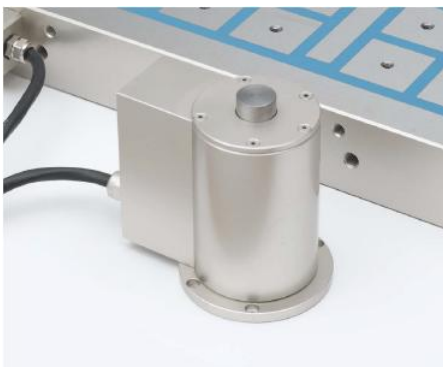
MAG Status: Pin is „above“.