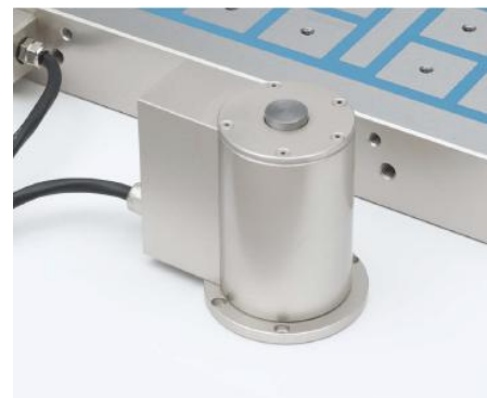
DEMAG Status: Pin is „below“.